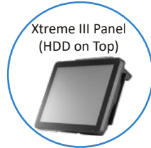
Xtreme III Panel (HDD on Top)