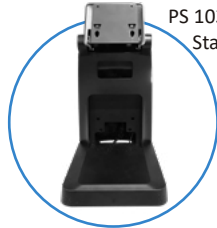
PS 103 POS Stand