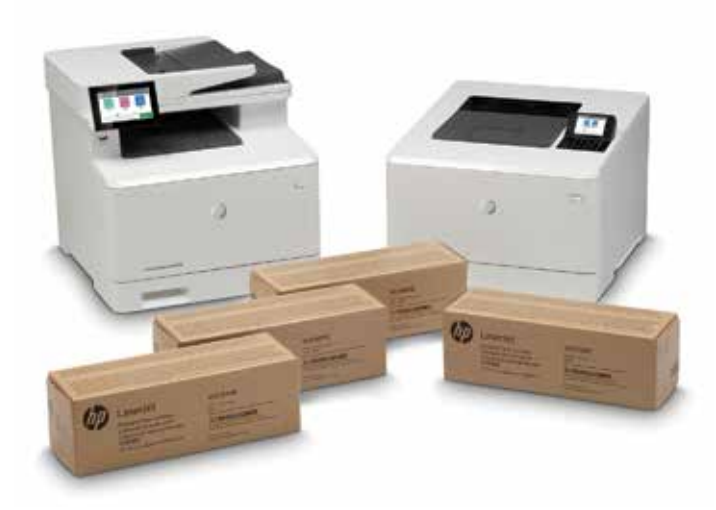
Original HP Managed LaserJet Toner Cartridges (~8,600 pages black, or ~6,900 pages color)<sup>26</sup>

Original HP Toner cartridges help protect against counterfeits. Anti-fraud technology authenticates that a genuine Original HP cartridge is installed and allows you to enable fleet-wide printing policies that support Original HP-only cartridges. HP design, production, and supply chain processes help keep your printing system secure, <sup>25</sup> and tamper-resistant chips help ensure customers get the Original HP quality they paid for.<sup>24</sup>